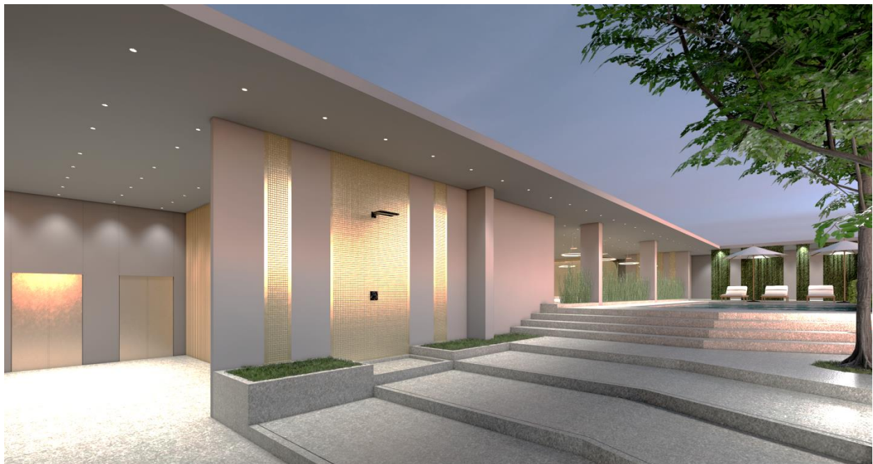
SWIMMING POOL AND LOUNGE AT 10 TH FLOOR