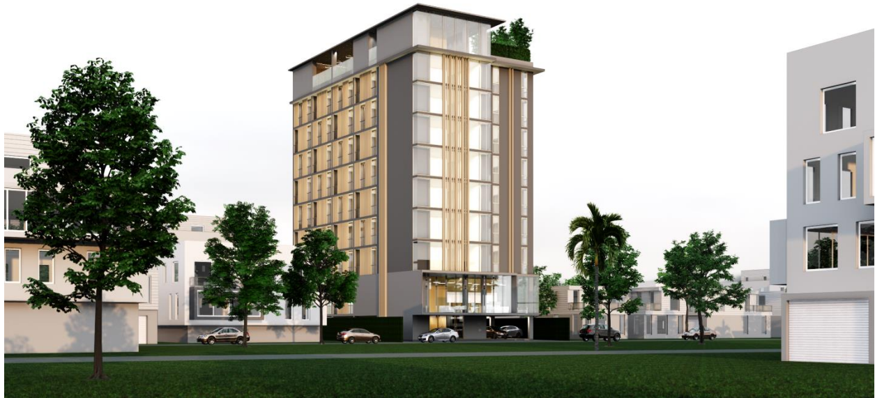
FRONT SIDE – ELEVATION