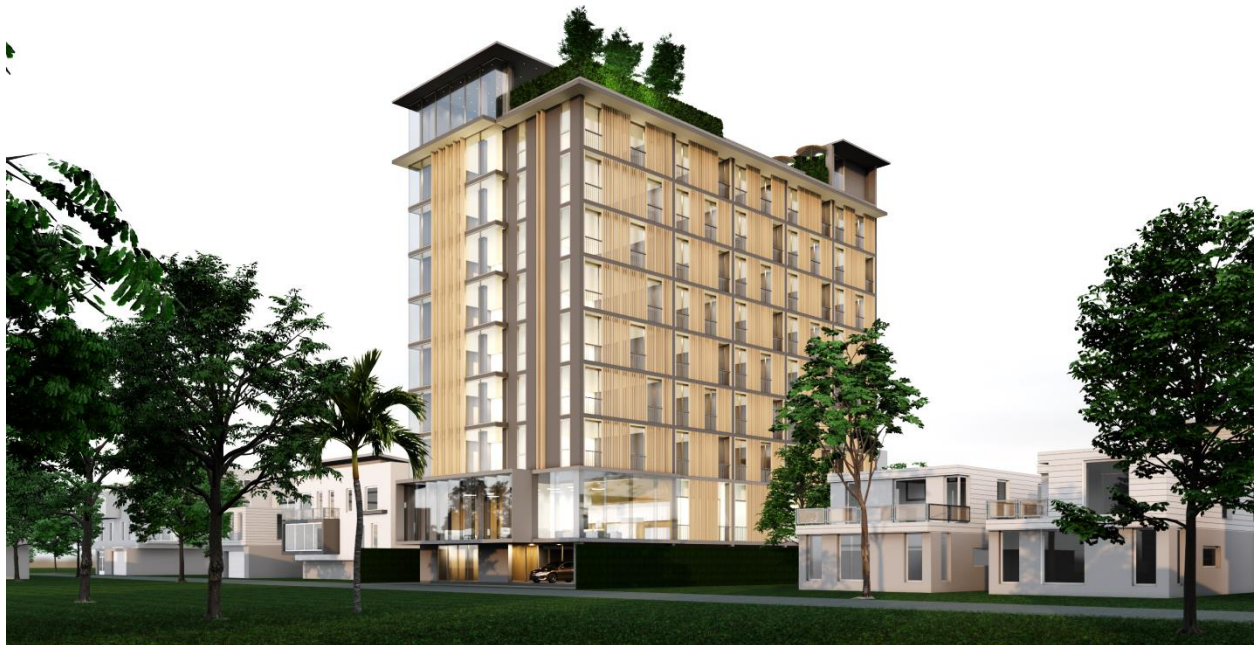
APPROACH TO THE FRONT AND MAIN ENTRY