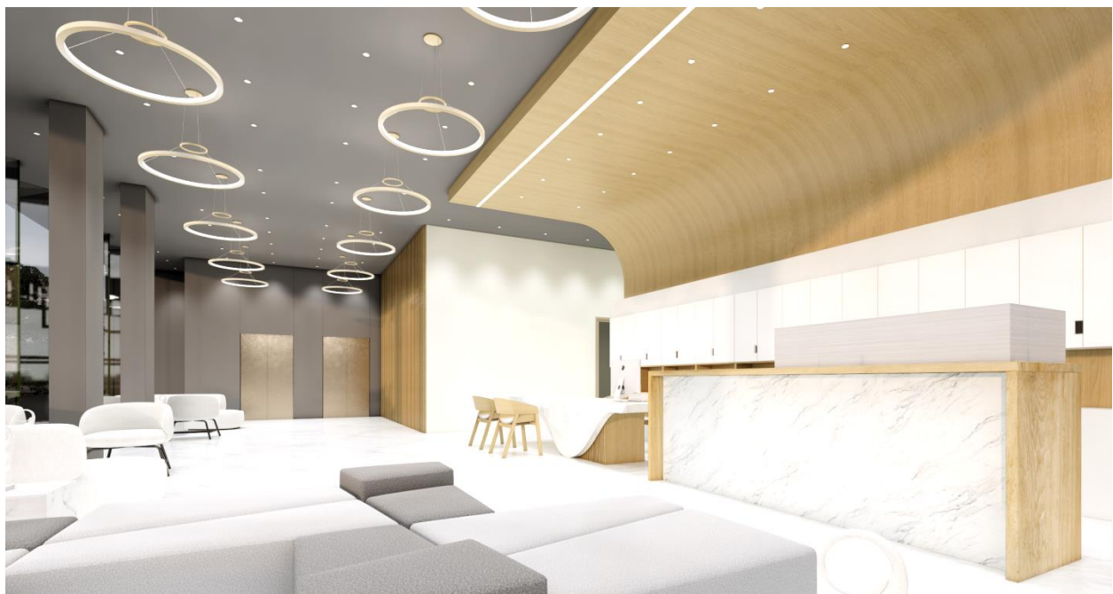
FRONT LOBBY AND LOUNGE AREA