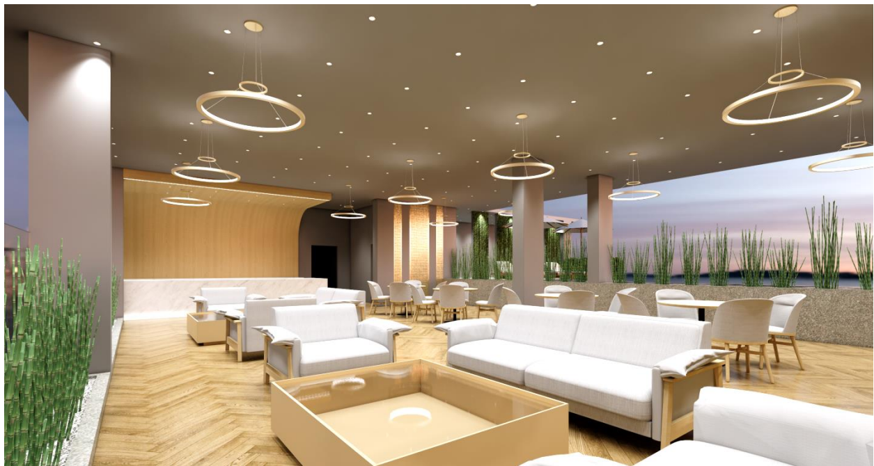
SWIMMING POOL AND LOUNGE AT 10 TH FLOOR