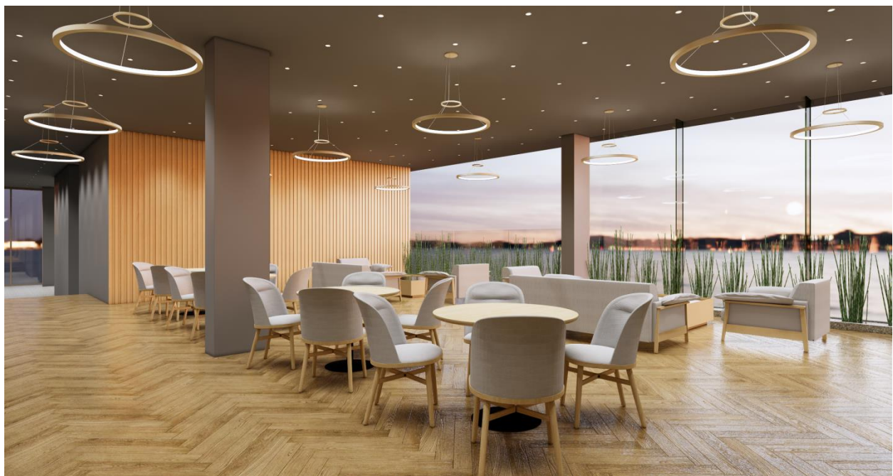
LOUNGE AT 10 TH FLOOR