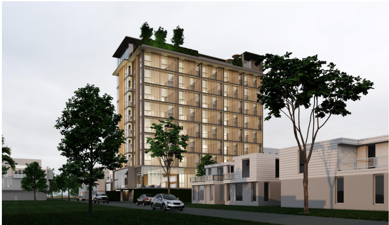
APPROACH TO THE FRONT AND MAIN ENTRY