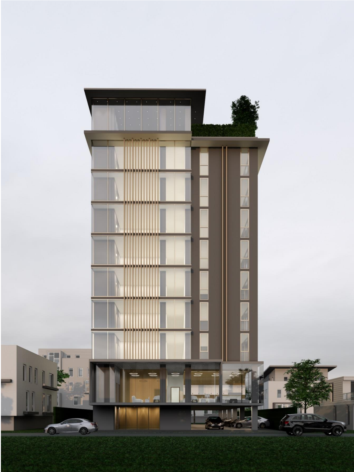
FULLY FRONT ELEVATION