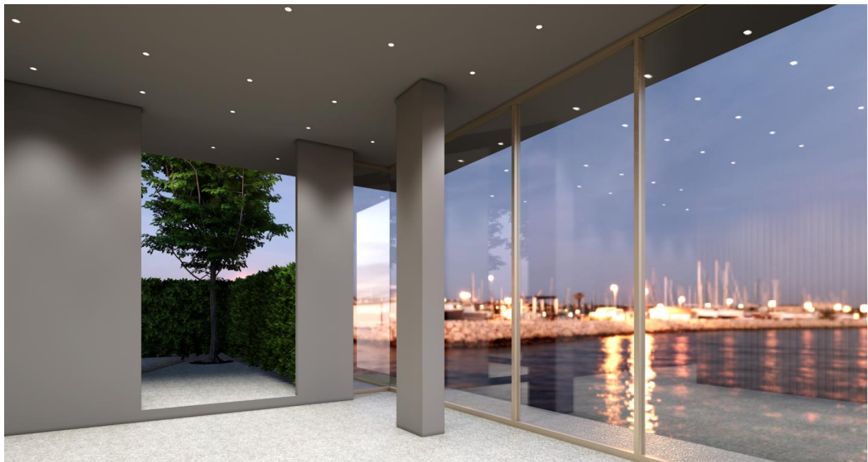
LIFT FOYER AT 10 TH FLOOR