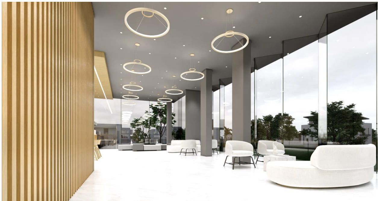
LOBBY HALL AT 2 ND FLOOR