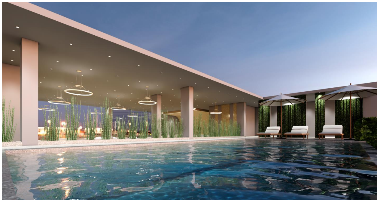
SWIMMING POOL AND LOUNGE AT 10 TH FLOOR