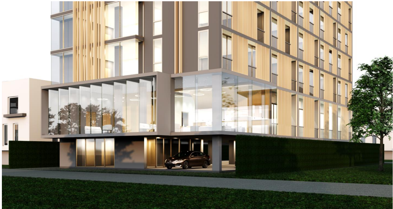
FRONT SIDE – ELEVATION